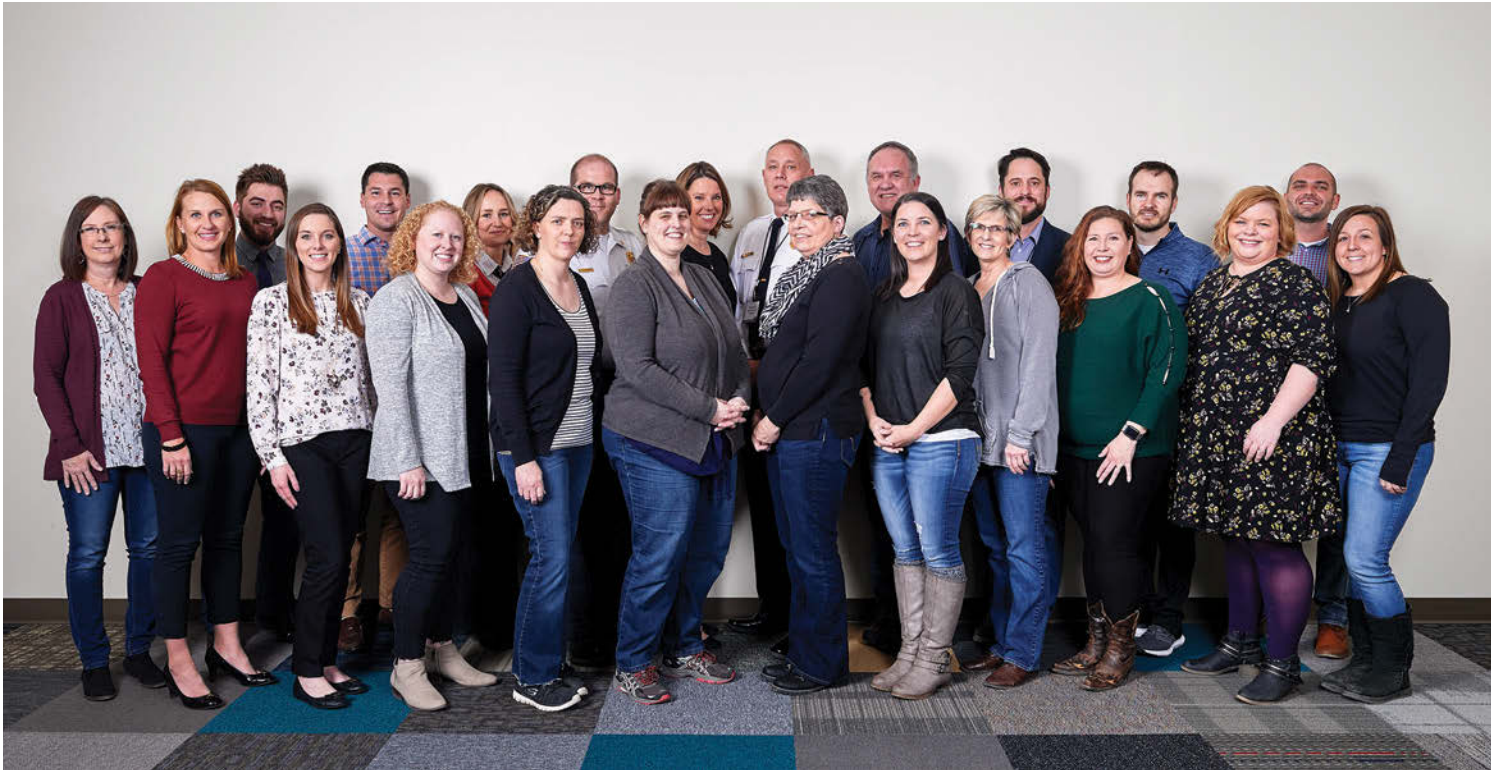
The inaugural class of Leadership Douglas County.