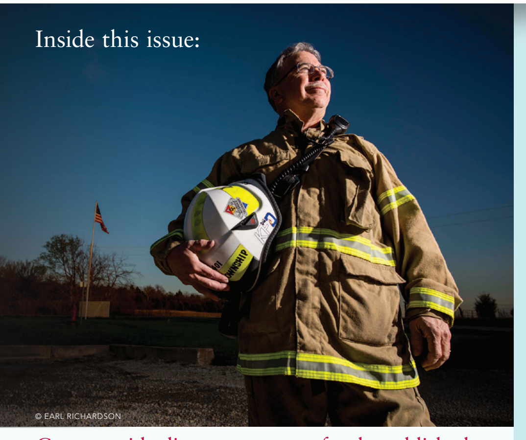
County-wide disaster response fund established

NON PROFIT ORG US POSTAGE PAID AMERICAN PRE-SORT INC