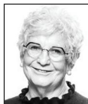
Deanell Reece Tacha United States Circuit Judge, United States Court of Appeals for the 10th Circuit (Retired)