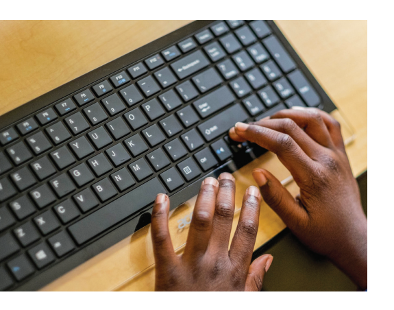
Students now need access to a computer and internet to do homework.