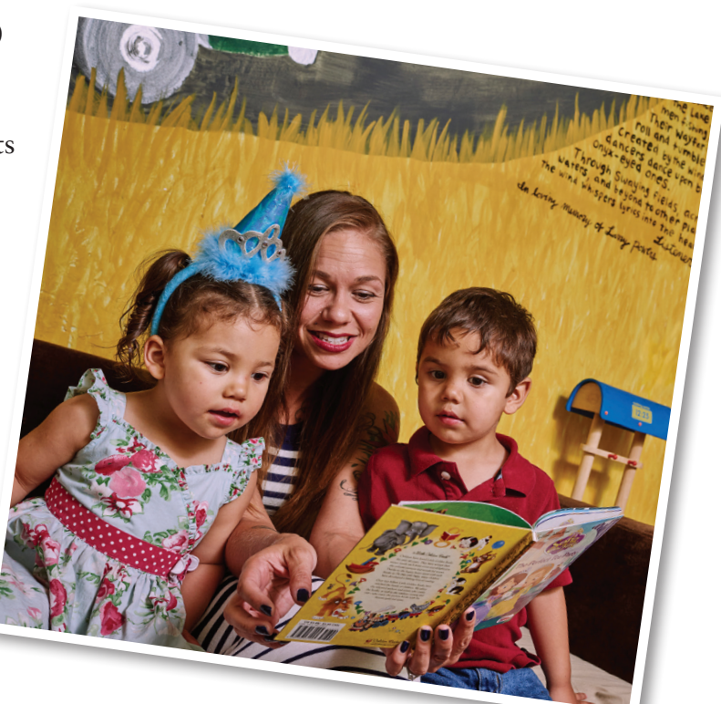
Family Promise will use its grant to expand services.

In addition to our Community Grants, we make grants year-round from many donor-advised, organization, field of interest and scholarship funds. We also hold separate grant competitions each year to fund environmental projects and efforts that support LiveWell Lawrence's community health goals.