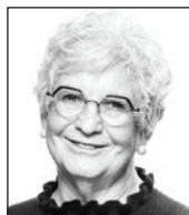
Deanell Reece Tacha United States Circuit Judge, United States Court of Appeals for the 10th Circuit (Retired)